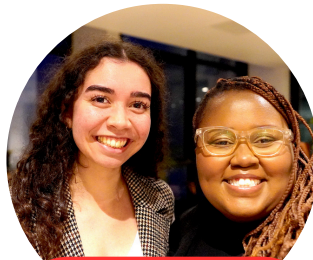
Parish Youth Coordinators